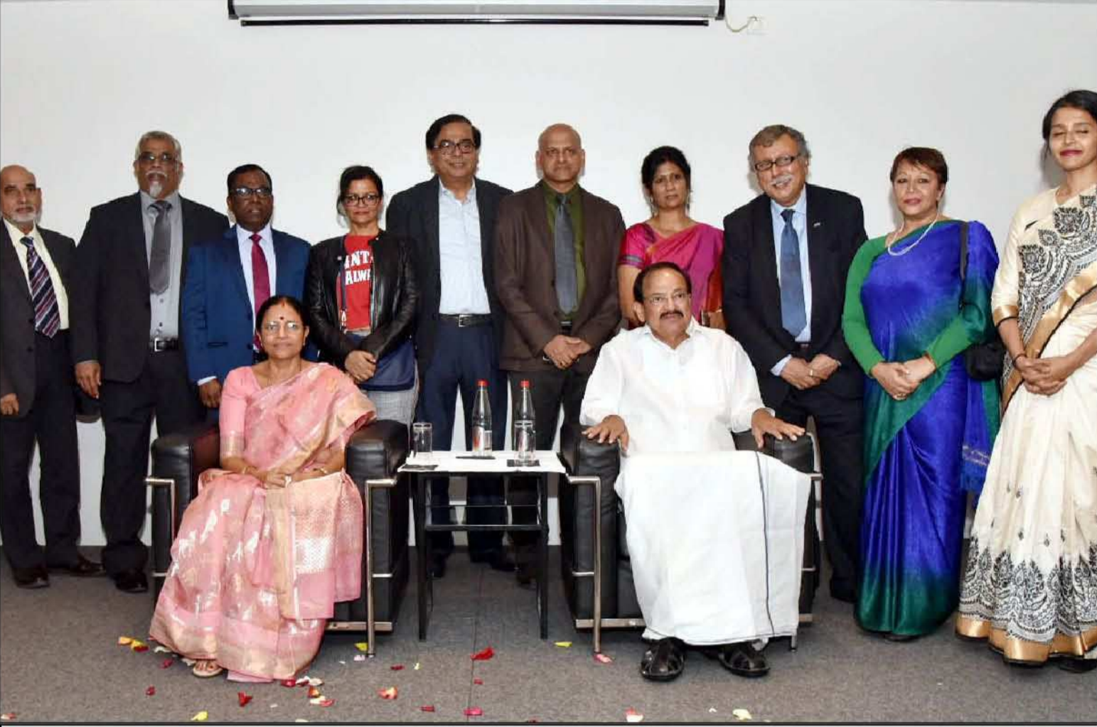
उपराष्ट्रपति, श्री एम वेंकैया नायडू और श्रीमती उषा नायडू पेरिस, फ्रांस में भारतीय सामुदायिक रिसेप्शन में भारतीय समुदाय के लोगों के समूह के साथ।