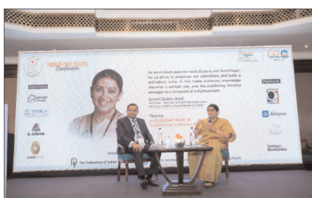
Unveiling the power of publishing and shaping the trajectory of our great nation through 2047

As India becomes a global power, the conference discussed how publishing contributes to economic growth, employment, and knowledge dissemina-