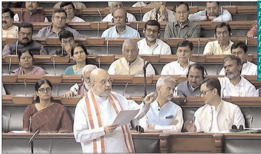
The Union Minister introduced the Bharatiya Nyaya Sanhita (BNS) Bill, 2023; Bharatiya Nagarik Suraksha Sanhita (BNSS) Bill, 2023; and Bharatiya Sakshya (BS) Bill, 2023 that will replace the Indian Penal Code, 1860, Criminal Procedure Act, 1898, and the Indian Evidence Act.

The Union Minister introduced the Bharatiya Nyaya Sanhita (BNS) Bill, 2023; Bharatiya Nagarik Suraksha Sanhita (BNSS) Bill, 2023; and Bharatiya Sakshya (BS) Bill, 2023 that will replace the Indian Penal Code, 1860, Criminal Procedure Act, 1898, and the Indian Evidence Act, 1872 respectively. The Union Minister said that the new bill to replace the Indian Penal Code (IPC) will repeal the offence of sedition which is criminalised