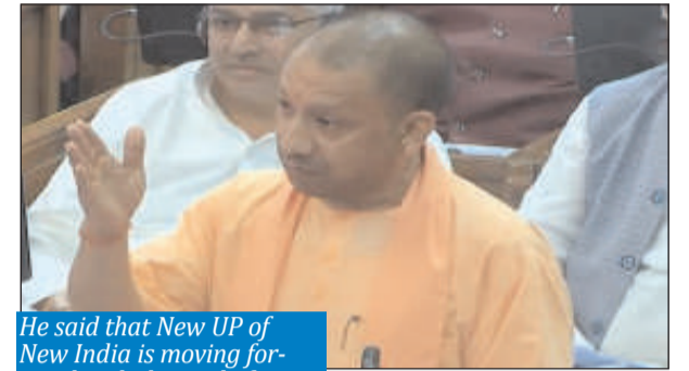
He said that New UP of New India is moving forward with the goal of becoming a trillion dollar economy and assured the farmers that the state government stands firmly with them during floods and drought.

Chief Minister Yogi Adityanath on Friday accused the Samajwadi Party (SP) of tarnishing the image of Uttar Pradesh and alleged that for SP, which follows casteism and dynasty politics, the poor and farmers can be an issue of caste and vote bank, but for his government the section of the society is like a family. During his around two-hour speech on the last day of the monsoon session of the Legislative Assembly, Yogi took a jibe at Leader of Opposition and Samajwadi Party (SP) president Akhilesh several times. He said that New UP of New India is moving forward with the goal of becoming a trillion dollar economy and assured the farmers that the state government stands firmly with them during floods and drought. Earlier, while attacking the CM, Akhilesh tried to corner the government by raising a barrage of questions on issues including farmers, law and order, infrastructure and electricity problems during his hour long