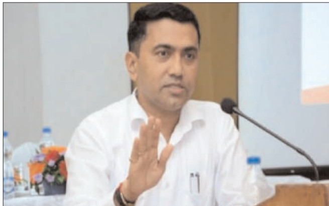
Coming out with this information in the state legislative assembly, Chief Minister Pramod Sawant on Thursday informed the House that these four reports include the ones from the principal chief engineer of the public works department, M/s RITES Ltd.

Speaking further, Sawant said the four reports obtained indicate that the failure of the structure is basically due to the corrosion of structural steel ISMB and N-Girders near support and also not being anchored or embedded in the RCC slab, thus causing reduction of load and moment resisting capacity of the structural members. "Hence, com-