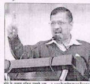
दिल्ली के मुख्यमंत्री अरविंद केजरीवाल ने 1 करोड़ से अधिक जांच की गई है।

से जरी बुद्धिमान के अनुसार, एक दिन करीब 63,161 जांच की जा चुकी है। यह जांच दिल्ली में जांच की संख्या में तेजी से वृद्धि हो रही है।