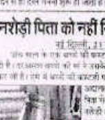
नरोड़ी पिता को नहीं मिली बच्चे की कस्टडी।

नरोड़ी पिता को नहीं मिली बच्चे की कस्टडी। नरोड़ी पिता को नहीं मिली बच्चे की कस्टडी।