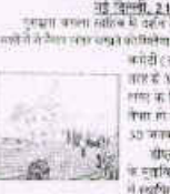
दिल्ली: गुरुद्वारा बंगला साहिब में मशरूम तैयार करेगी लंगर।

दिल्ली: गुरुद्वारा बंगला साहिब में मशरूम तैयार करेगी लंगर। मुख्यमंत्री अरविंद केजरीवाल ने इस पर 1 घंटे की वार्ता में बताया है।