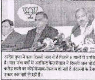
आप सरकार पर 26 हजार करोड़ घोटाले का आरोप लगाया है।

नई दिल्ली 21 जनवरी दिल्ली के मुख्यमंत्री अरविंद केजरीवाल ने आप सरकार पर 26 हजार करोड़ घोटाले का आरोप लगाया है।