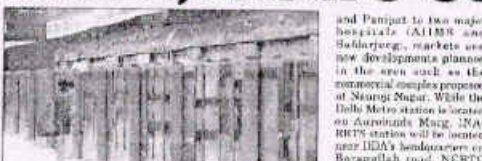
INA station will be integrated with the Delhi Metro's INA station through a subway, thereby providing safe and seamless connectivity between the two modes of public transport for commuters.

MM BUREAU New Delhi/January 21 The National Capital Region (NCR) Development Authority (NCTDA) will integrate its INA station with the Delhi Metro Rail Corporation (DMRC) station at the same spot in the eastern part of the city.